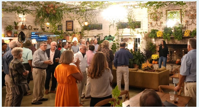
Top: The Campaign Cabinet and Federation Board Members celebrate the groundbreaking at the site (left) and with campaign supporters (right). Construction began in October 2024 (below), with a grand opening anticipated in 2026.