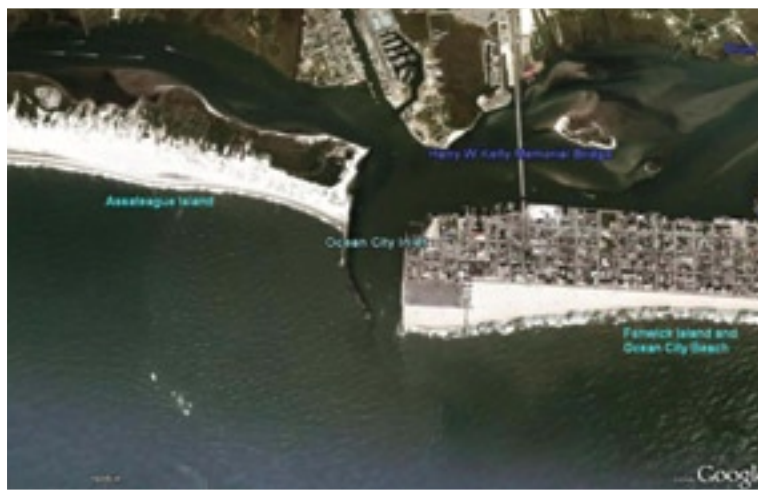
Ocean City Inlet in Maryland

House members this year using its battery of influential property owners and campaign contributors. The N.C. General Assembly was still