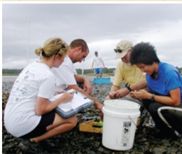
Volunteers measure the growth of oyster reefs in Dicks Bay in Onslow County.