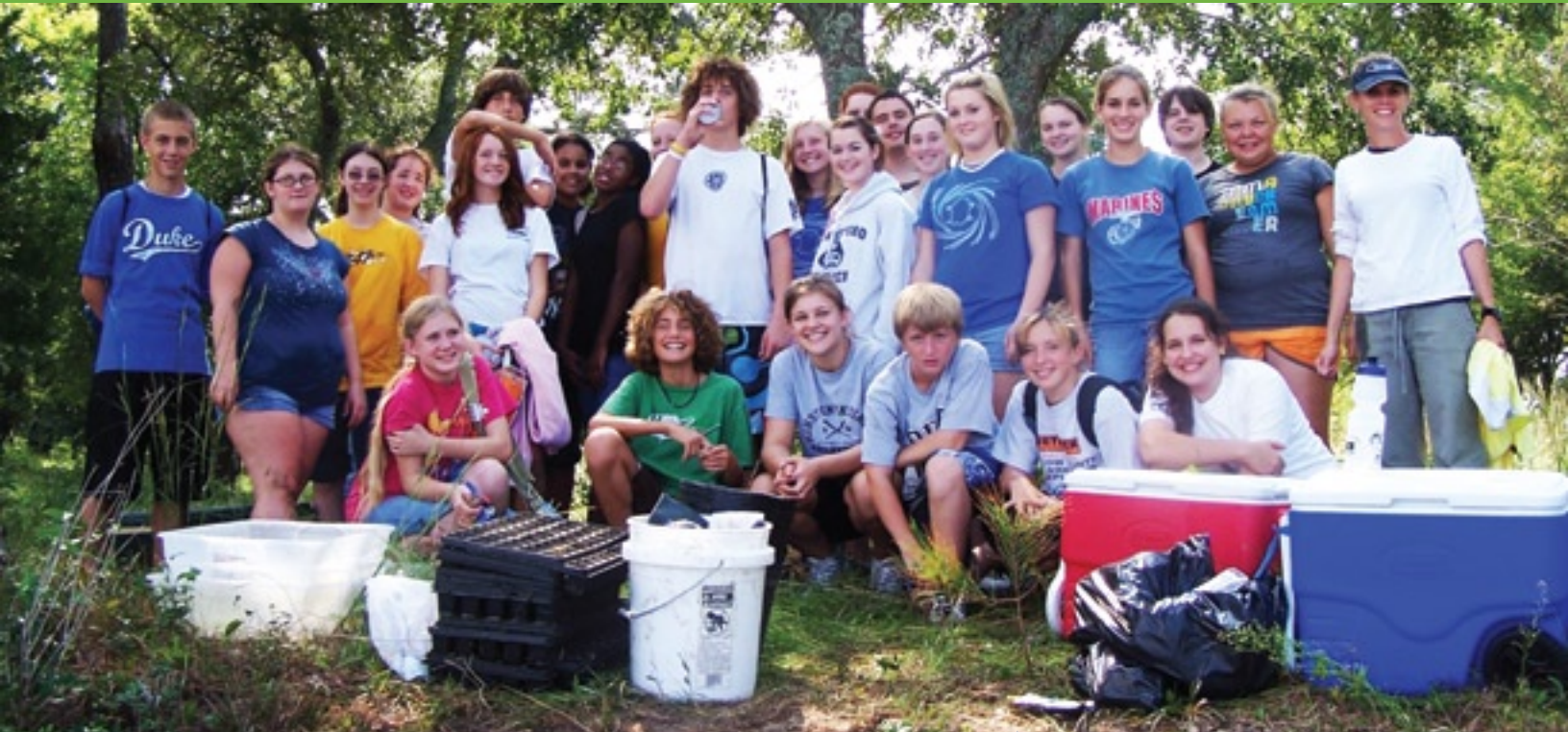
Swansboro High School students are all smiles after helping restore shoreline on Jones Island in the White Oak River.

❑ Partnered with Cape Lookout National Seashore and the Core Sound Waterfowl Museum and Heritage Center to develop a stormwater master plan for the two sites and install a series of LID stormwater techniques. The project is funded by North Carolina Sea Grant and the N.C. Clean Water Management Trust Fund.