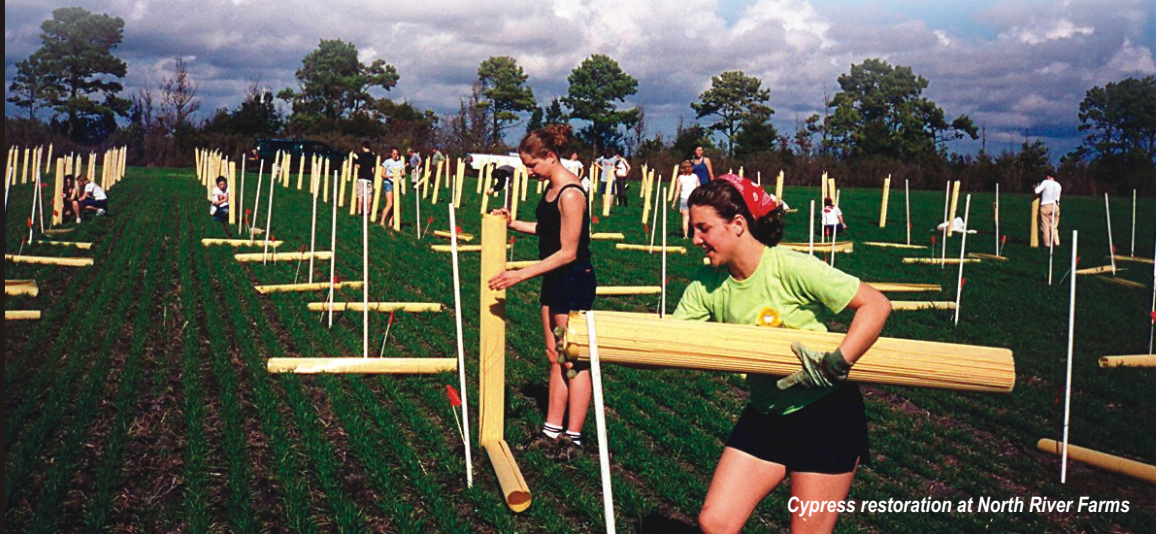
Cypress restoration at North River Farms

In 1999, NCCF purchased 1,991 acres of land at NRF for $1,071,000 with a grant from NC's Clean Water Management Trust Fund (CWMTF). In 2002 NCCF purchased an additional 2,168 acres of NRF for