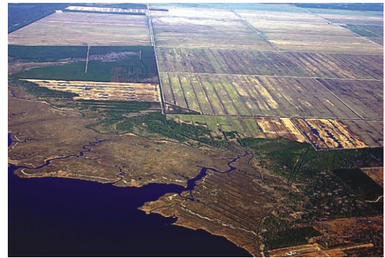
View of Phase I restoration at North River Farms.

Numerous granting agencies have participated in the restoration efforts of North River Farms. NOAA, EPA, US Fish and Wildlife Service, FishAmerica Foundation, NC Albemarle-Pamlico National Estuary Program, and North Carolina Wetlands Restoration Program are among the partners who have contributed to the success of this project.