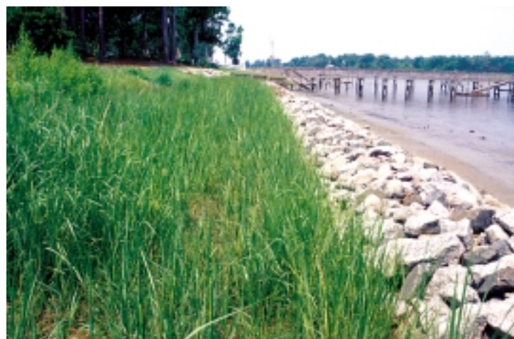
Same shoreline after regrading of eroding banks and stabilization with stone sill.