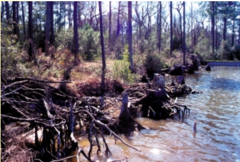
(left) Boat wakes can cause erosion in areas that otherwise would suffer little erosion from natural wave action. (below) Vertical walled bulkheads can cause increased erosion of adjacent shoreline by reflection of wave energy.

A s the owner of shorefront property, you must examine your property and determine what erosion forces are at work. They will be different depending on whether you have property that is exposed or sheltered, high bank or low bank, etc. The process of shoreline erosion may be due to natural causes such as the interaction of tidal action with the bank face. The erosion may be accelerated by activities such as boat wakes or high waves during storms. Each year, this erosion causes the loss of valuable shorefront property. In addition, bank erosion can adversely affect the living resources of our bays and waterways by increasing sedimentation and turbidity which decreases the light penetration needed to sustain critical underwater vegetation and habitat. Conversely, placement of hard structures along estuarine shorelines often leads to losses of valuable wetlands and natural buffers, and may increase erosion on adjacent shorelines.