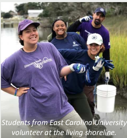
Students from East Carolina University volunteer at the living shoreline.