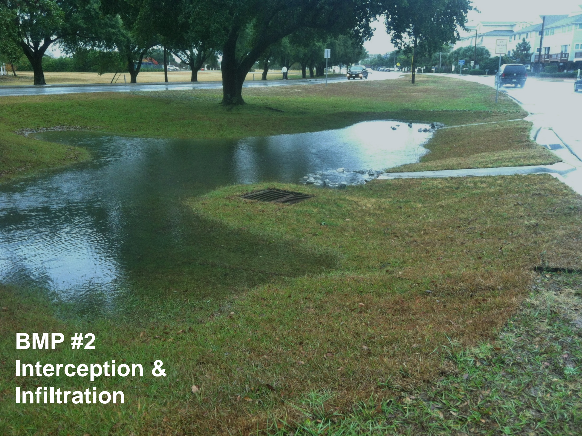
BMP #2 Interception & Infiltration