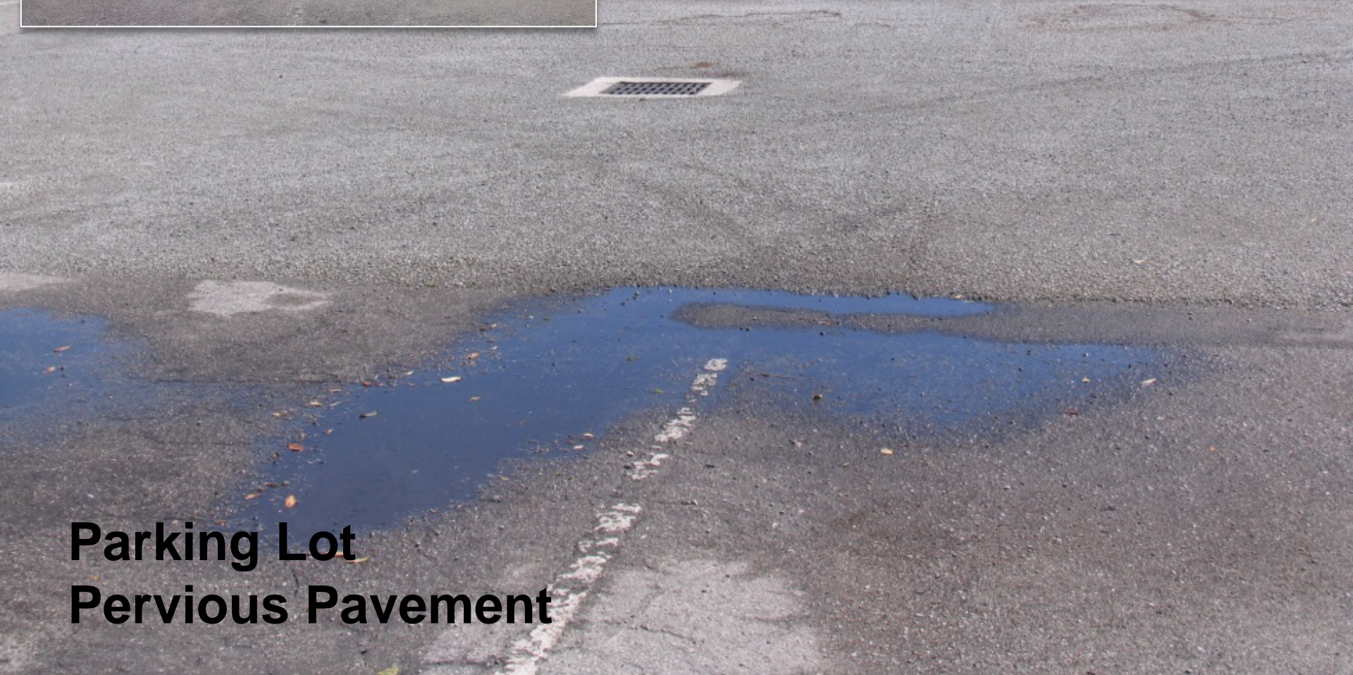
Parking Lot Pervious Pavement