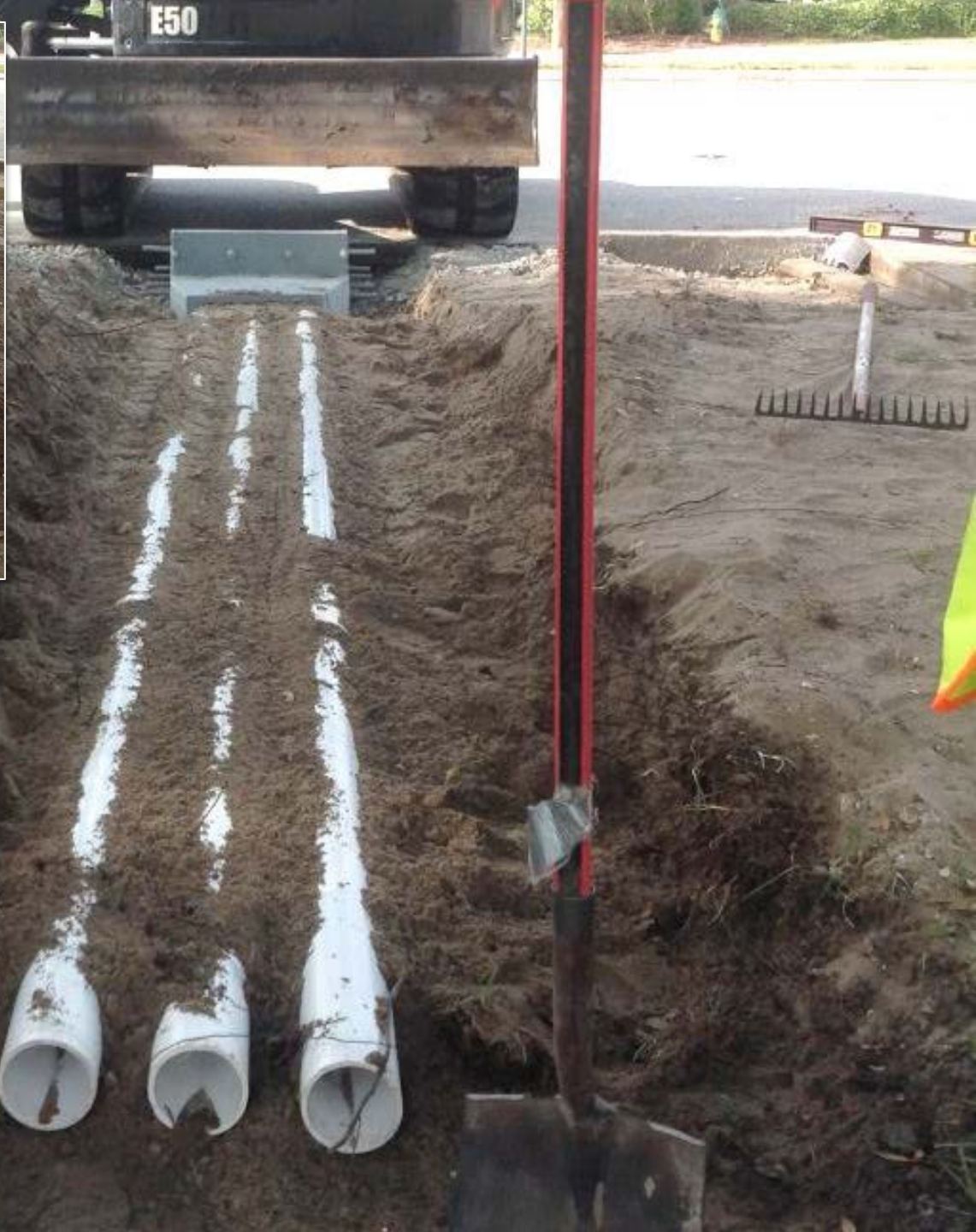
BMP #3 Interception & Infiltration