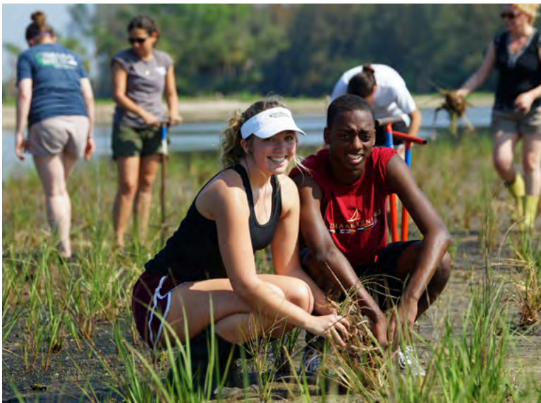
Rock Ponds Restoration, Tampa Bay; ©Peter Clark

Finally, the private sector capacities can be increased by partnering with NGOs and other volunteers. The examples of NGOs providing volunteer labor and lowering construction costs for living shoreline projects are myriad. By utilizing these resources, the economics of living shoreline projects are enhanced while providing significant public education and expansion of advocacy base opportunities.