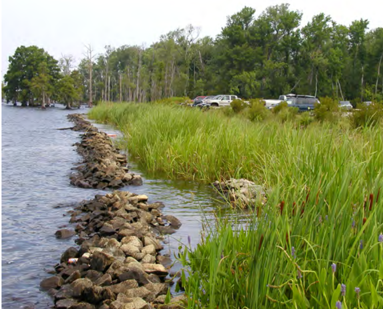
Living Shorelines Project at the Edenhouse Boat Ramp, Edenton, NC

Agency leadership would also be valuable in broadening planning perspectives and working across jurisdictions to collaboratively achieve meaningful regulatory reform.