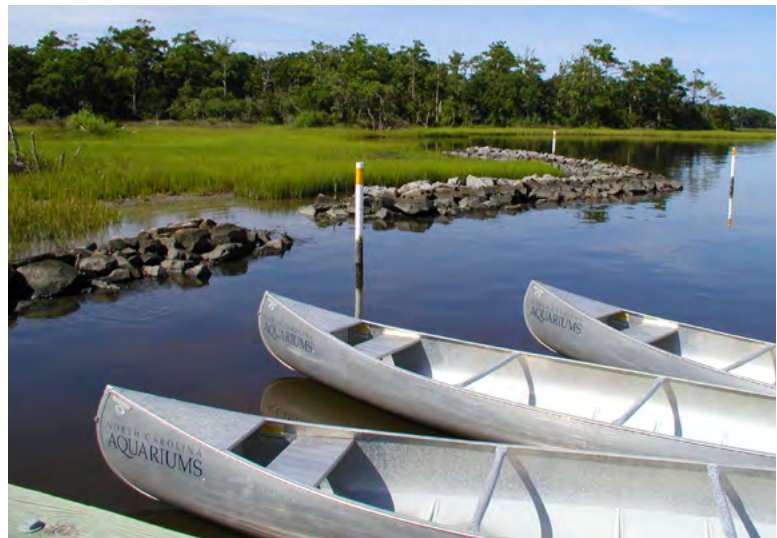
Living Shorelines Project at NC Aquarium at Pine Knoll Shores

Decision-making without consideration of the broader context also fails to consider the multiple values created by living shorelines and overlooks their systemic advantages, both to the landowner and to other users of the estuary. (See IV, G, above). System-wide planning is also a vehicle for living shorelines to provide mitigation for unavoidable habitat loss elsewhere in that system.