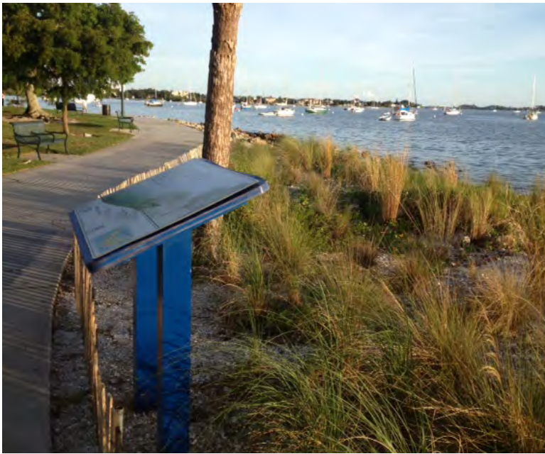
Living Shorelines Project, Bay Front Park, Sarasota, FL

This coordination across agencies can be accomplished in several ways. At the federal level, the possibility of an MOU between the many agencies affected by living shoreline issues (e.g., EPA, Corps, Department of Defense (DOD), Department of the Interior, Department of Commerce, etc.) should be explored. This approach is especially critical in light of the other federal priorities described above which are currently unaddressed in shoreline permitting. At the state-federal interface, many jurisdictions have already implemented a joint-permitting process for shoreline projects as a means to coordinate project review. States should also work with federal regulators to develop RGPs for living shorelines installations.