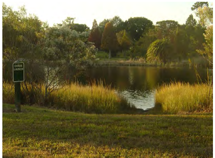
Living Shorelines Project, Rivercrest Park, Tampa, FL

Successfully pursuing these strategies will require a vigorous dedication to substantively reforming how we are managing our shorelines. Dedication alone will not be enough. Leadership and coordination of efforts will be necessary to effect change. In the committee's opinion, significant leadership can be provided at this stage by the non-governmental organization (NGO) community working together in a focused way to advance these strategies. It is important that all living shoreline constituencies, public or private, be involved in the effort to bring about the needed reforms to overcome institutional barriers.