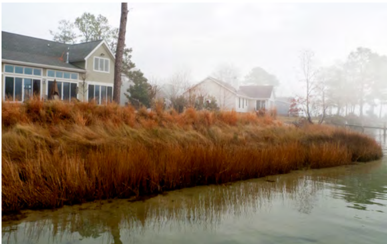
Fish Camp in the Fog, MD

As discussed earlier, current research demonstrates the many benefits to clean water and healthier estuarine ecosystems flowing from the use of living shorelines instead of continued hardening. The values generated for the public—clean water, healthy fisheries, superior recreational resources, improved property values and tax base—all should be of significant importance to government at all levels. In addition, the use of living shorelines as a method of complying with TMDL mandates (as is about to happen in MD and VA) is an example of a direct benefit to the public agencies charged with achieving compliance with the CWA, and therefore of direct economic benefit to the taxpayers of that jurisdiction. Government support for living shorelines could also encourage new and innovative designs and techniques for using living shorelines.