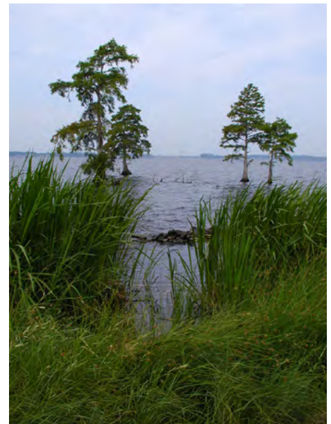
Living Shorelines Project at the Edenhouse Boat Ramp, Edenton, NC

The EPA developed CWA § 404(b)(1) guidelines, which establish the environmental criteria for evaluating a project under the federal wetlands permitting program. 71 The § 404(b)(1) guidelines require the selection of a practical alternative that is the least damaging to the environment. Since it is now clear that living shorelines are generally the least damaging management