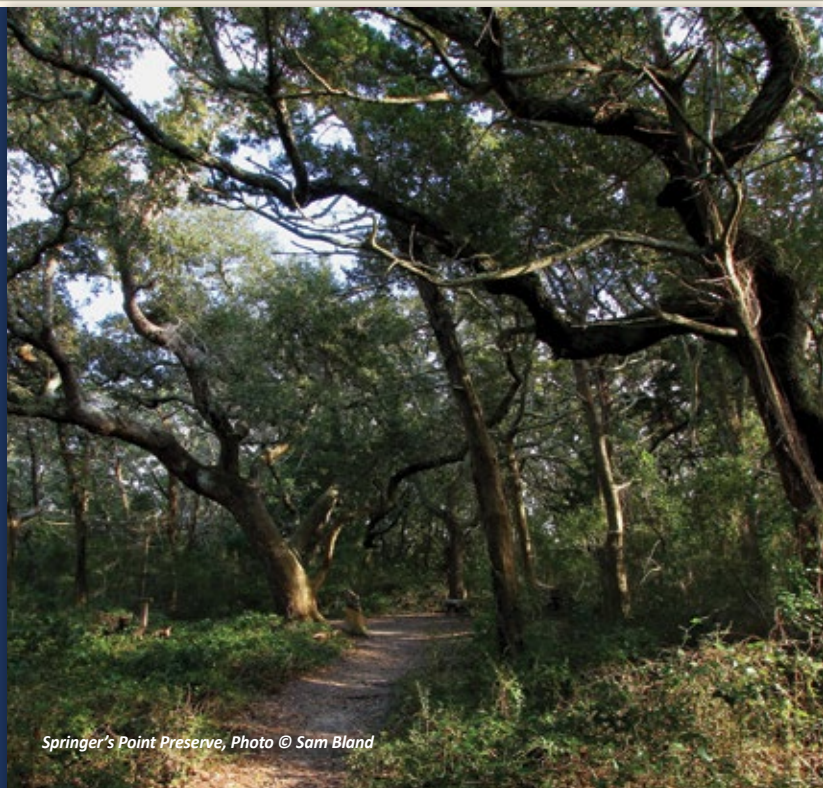
Springer's Point Preserve

Springer's Point Preserve is a beautiful maritime forest in Ocracoke Village. It's home to a variety of bird and plant species, including ancient live oaks. We helped with a living shoreline on the preserve. Please plan to travel there by foot or bicycle, as there is no parking available.