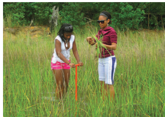
The landscape scale restoration project at North River Farms restored wetland habitat and reduced agricultural runoff to coastal waters.