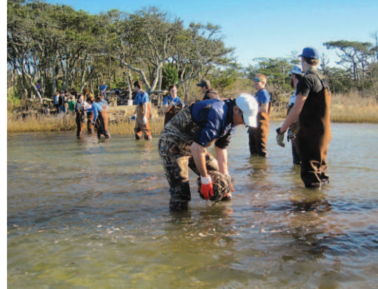
Volunteers pitch in to restore oyster habitat and stabilize an eroding shoreline at the Trinity Center in Pine Knoll Shores.