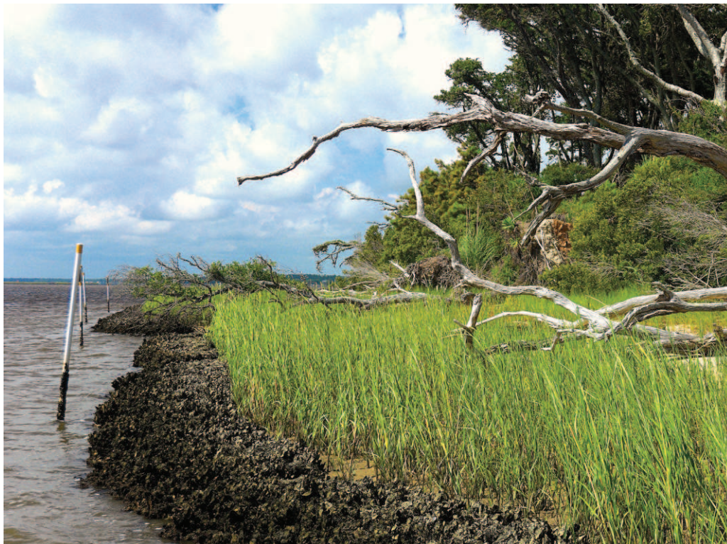
Restored oyster reefs and wetlands now protect the shoreline at Jones Island, a centerpiece for recreation and education activities in the White Oak River.