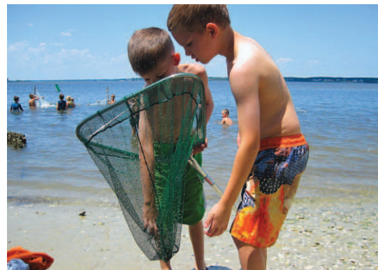
The federation's education program offers hands-on learning opportunities for students up and down our coast.