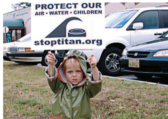
Citizens of all ages continue to oppose the Titan America cement plant proposed along the Northeast Cape Fear River. The federation leads this effort to prevent negative impacts on public health, wetlands, air and water quality, and the regional economy.