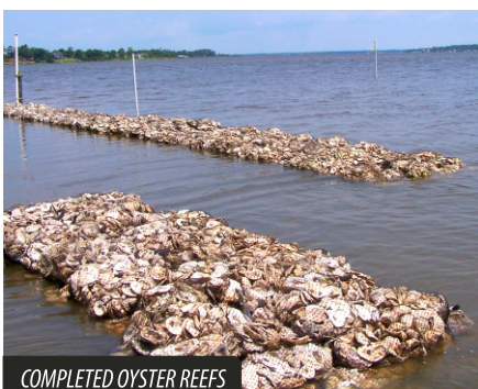
COMPLETED OYSTER REEFS