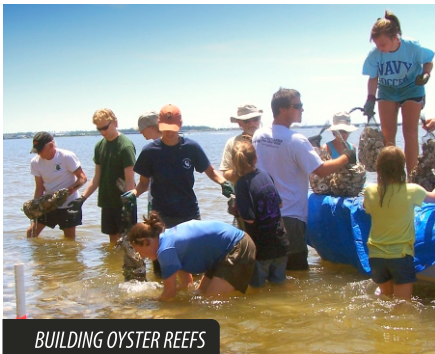
BUILDING OYSTER REEFS