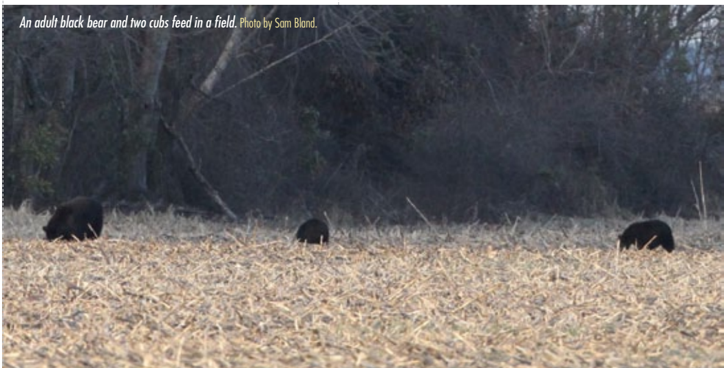
An adult black bear and two cubs feed in a field.

Just a short drive down the dusty road is the Duck Pen Wildlife Trail that leads to the Pungo Lake Observation Point. A blind provides excellent concealment allowing you to see a variety of ducks. As you walk down the trail you will notice that the surrounding land is quite