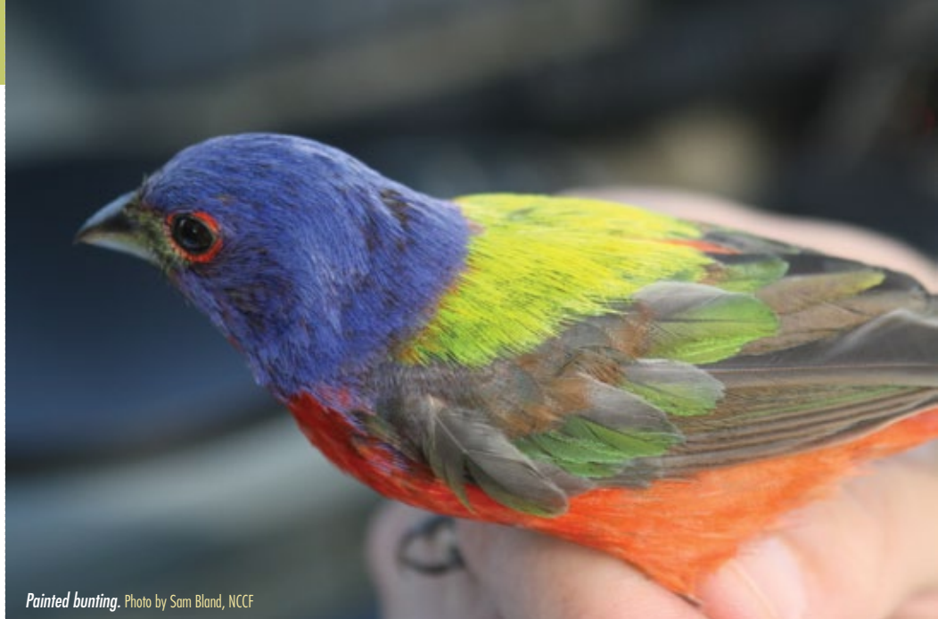
Painted bunting.

federation bought most of the uninhabited island after owners announced plans to develop it. It then donated the land to the park and worked with the park to establish an environmental education and restoration center on the island. Work will be going on all summer to restore the island's marshes and