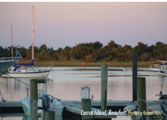
Carrot Island, Beaufort.

Emerald Isle received a state grant to buy 43 acres along Bogue Sound to build a public park that could also be used to control stormwater. The result is EMERALD ISLE WOODS (MAP #13) off Coast Guard Road. The park has several hiking trails, a bathhouse, picnic shelter, and floating dock on Bogue Sound.