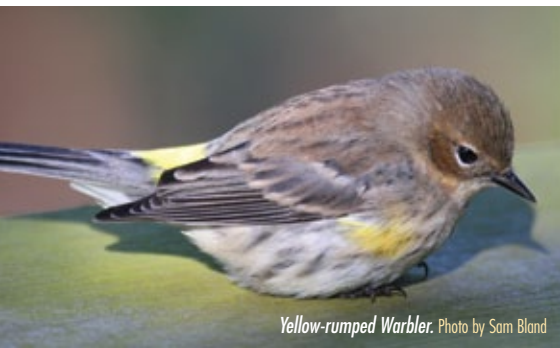
Yellow-rumped Warbler.