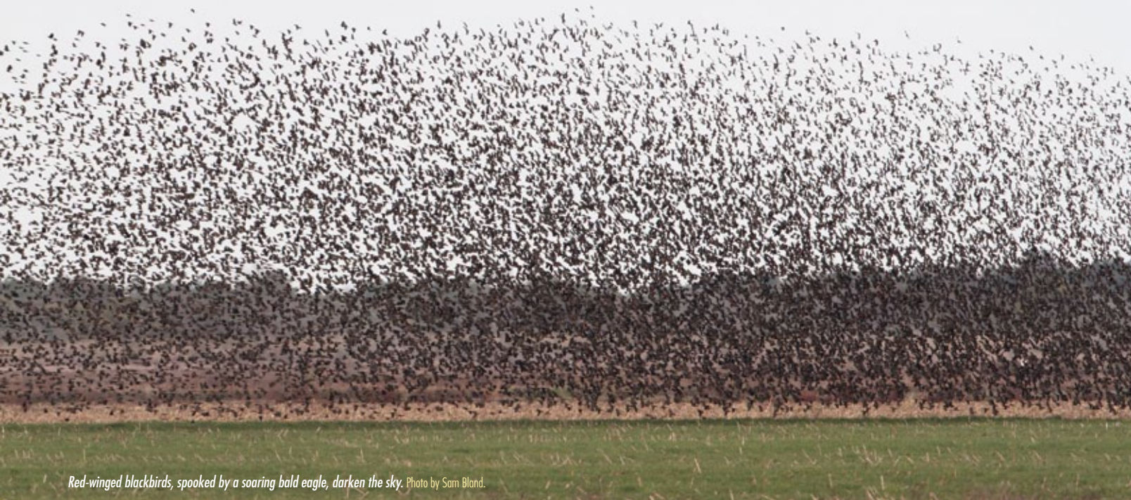
Red-winged blackbirds, spooked by a soaring bald eagle, darken the sky.

wet with standing water. This is a pocosin, the Native American word for “swamp on a hill.” This bog is thick with evergreen shrubs such as wax myrtle, sweet bay and red bay with a few pine trees scattered around.