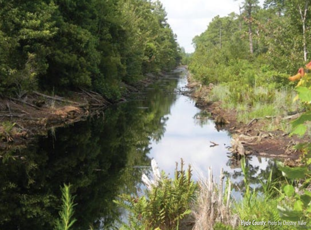
Hyde County.

In a rural region hungry for jobs, Peat Methanol's proposal to build a peat-burning plant in Tyrrell County was welcome news.