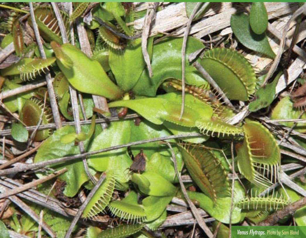
Venus Flytraps.

zones between dry longleaf woodlands and wet pocosin habitat.