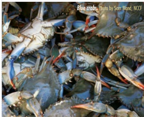
Blue crabs.

The HAYWOOD LANDING RECREATION AREA (MAP #21) on N.C. 58 south of Maysville offers a glimpse of a river that few people see. Here you can launch your canoe, kayak or shallow-draft boat to explore the freshwater