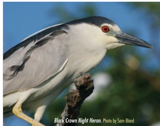
Black Crown Night Heron.

The landing has long been a place where locals went to do all those things. But heavy