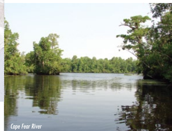
Cape Fear River

Coursing lazily some 130 miles through the state's southeast coastal plain, the Northeast Cape Fear suffered a number of major spills from hog lagoons and an oil spill from a now-defunct metal recycling plant in the 1990s. It recovered from all that only to have industrial developers eye it for a cement plant that will rip up its life-sustaining wetlands and