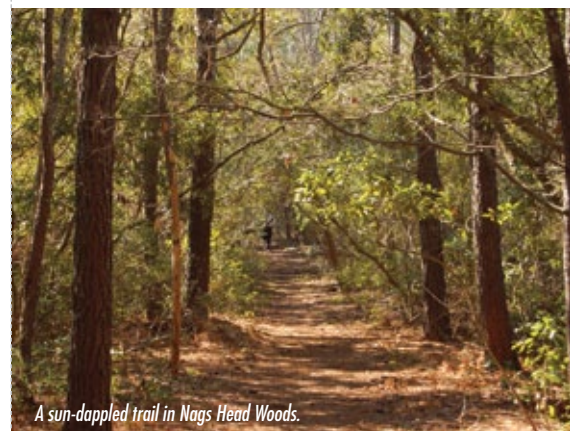
A sun-dappled trail in Nags Head Woods.

Defeat of the OLF preserved the natural beauty of the Albemarle Pamlico region. It's remote and still buggy, but well worth exploring on your way to the more famous islands of the Outer Banks.