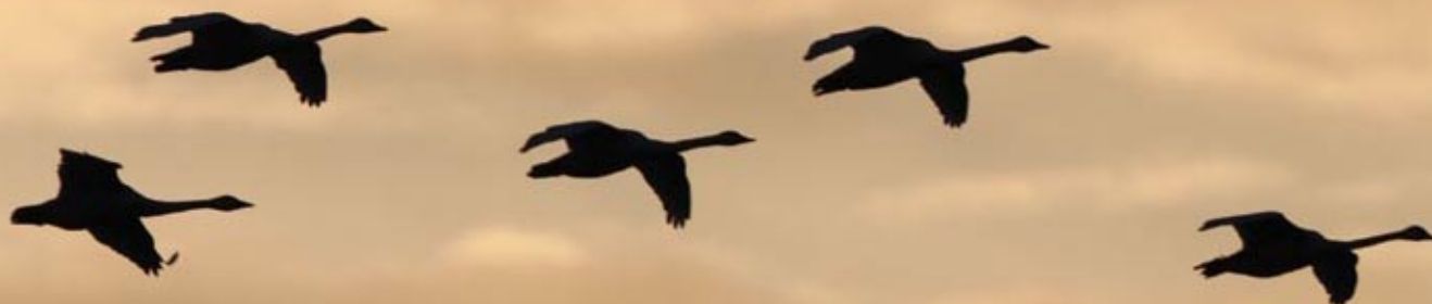
Tundra swans glide over Pungo Lake as the setting sun casts a golden shine on the clouds.