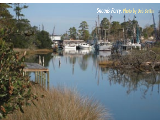
Sneads Ferry.