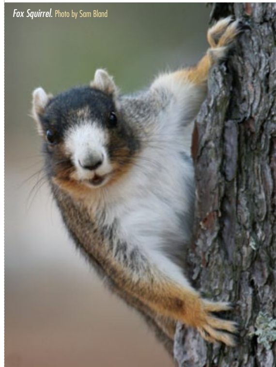
Fox Squirrel.

The rare carnivorous plants commonly grow in Holly Shelter savannas – the transition