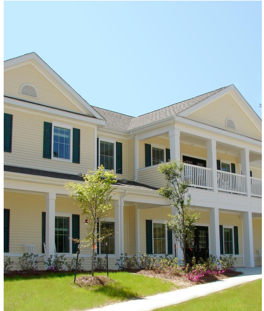
Atlantic Marine Corps Communities, Tarawa Terrace Community Center