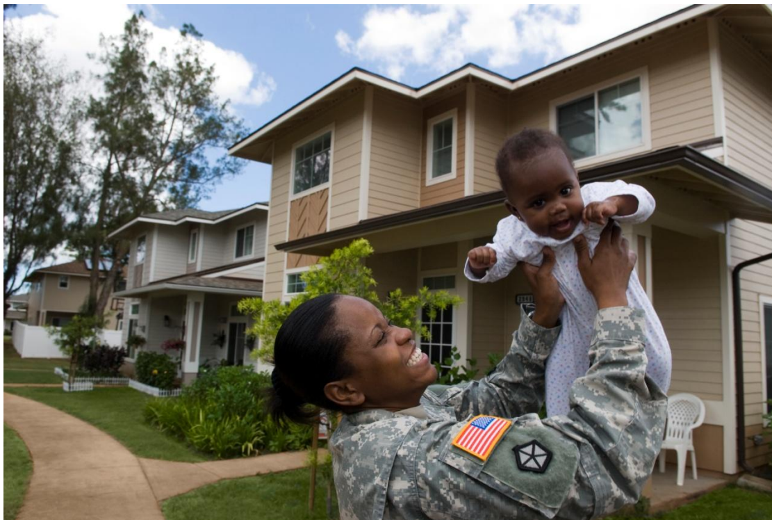
Island Palm Communities, HI